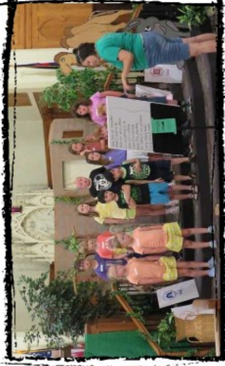
2024 Vacation Bible School - "Hometown Nazareth"

Joint VBS was held July 8th-11th at St. John's in Boone Twp.