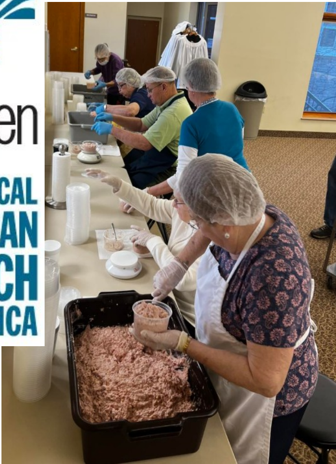
Almost 1,200 pounds of ham salad made by hand over the past three days! Couldn't do it without the group of dedicated volunteers that give so generously of their time to make this project a success every six months! And a huge shout out to our customers who ORDER all the product, and come calling for more! We are a fortunate congregation to have so many great folks on both sides of the counter!